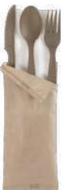
Sugarcane Fiber Knife+Fork+Spoon +Napkin Sets