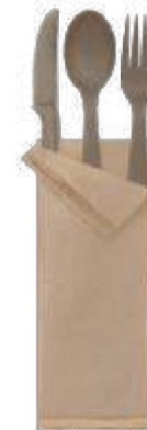
Sugarcane Fiber Knife+Fork+Spoon Sets